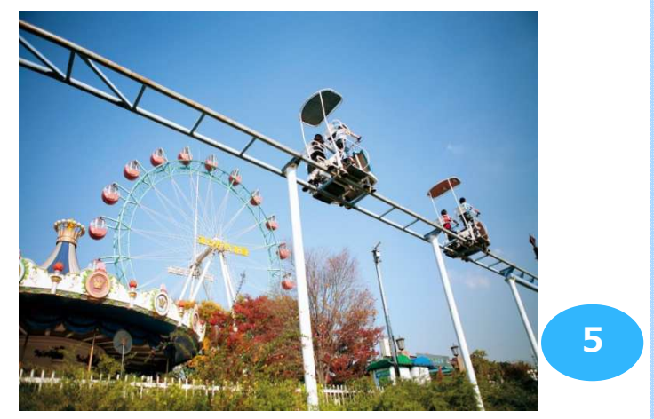
Arakawa Yuen (Arakawa Amusement Park)