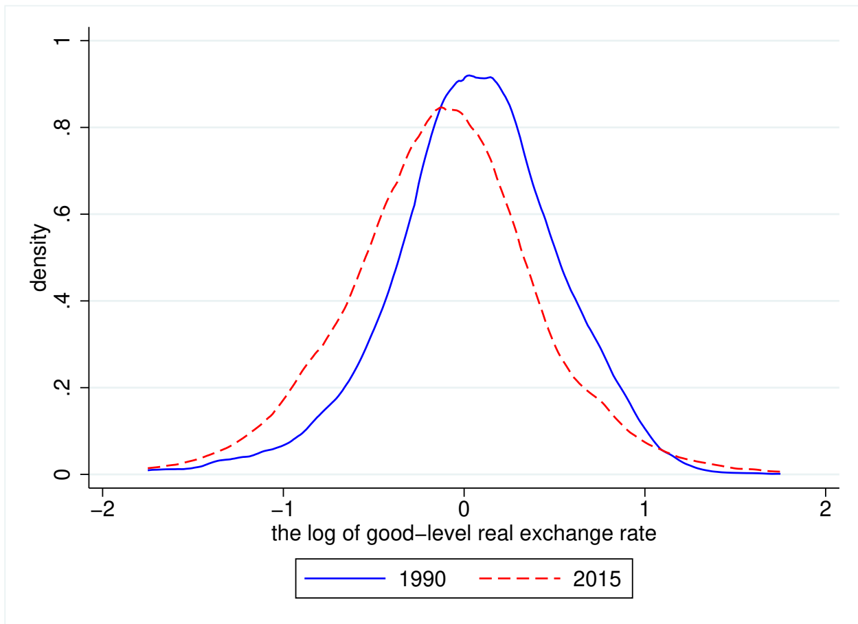
Figure 1: Empirical distributions of the good-level real exchange rates