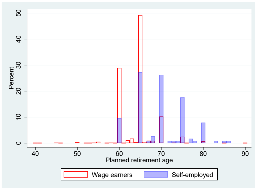
Figure 3 Distribution of planned retirement age

Note: The figure is drawn from a question in the 2017 wave of the JHPS/KHPS, which asks non-retirees about their planned retirement age.