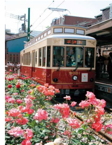
Toden Arakawa Line