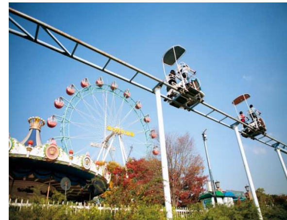
Arakawa Yuen (Arakawa Amusement Park)